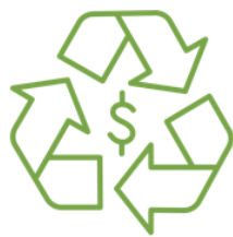
BIG MOVE 5 Zero-Waste/Circular Economy