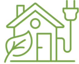
BIG MOVE 4 Zero-Carbon Homes & Buildings