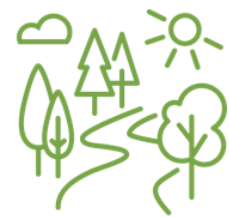
BIG MOVE 8 Healthy Urban Ecosystem