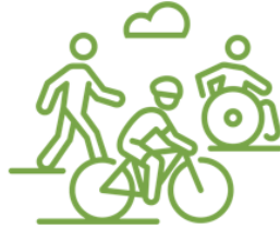
BIG MOVE 2 Car-Light Community