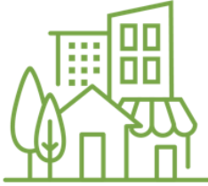
BIG MOVE 1 Low Carbon Development

Identify the CCAP Big Move(s) your project supports (check all that apply) and briefly explain how/why: