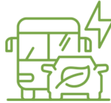
BIG MOVE 3 Zero-Emissions Transportation